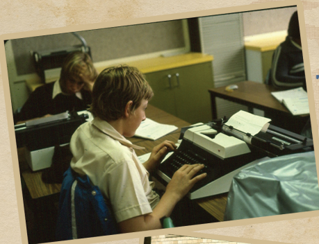
TYPING CLASS 1980